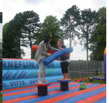
The photos shown above are from the QV Foods Fun Day held on Saturday 23rd July, with the monies raised being split between Epilepsy Connections and Storm UK Holbeach Kickboxing Club. Therefore we were delighted to receive £625 from the Fun Day plus a donation of £400 from QV Foods Ltd. A massive thank you goes to everyone involved for their generosity.