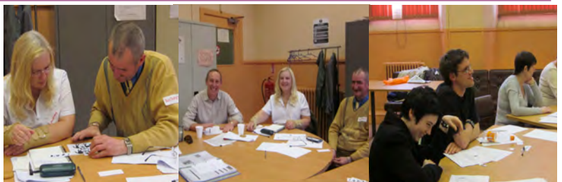
Confidence Building Workshop held in Falkirk on 22nd June 2011

The workshop will include presentations, memory skills practice and other exercises. You can book your place for this informative and fun day at http://www.epilepsy.org.uk/services/local-events If you don't have access to a PC, call us and we'll send you a booking form.