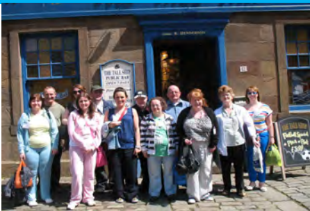
Friends Connected outing on 9th July to the set of River City.