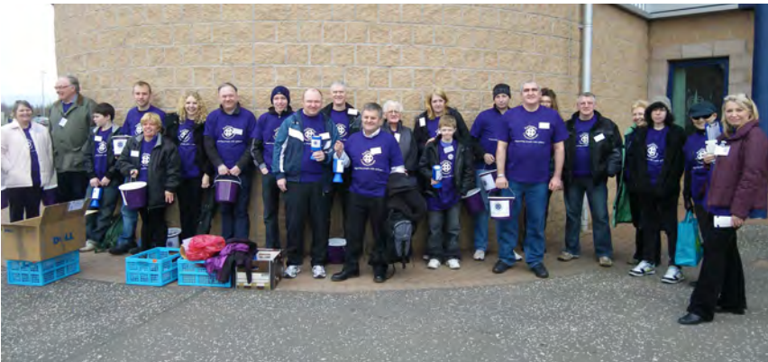
Our band of willing volunteers and staff outside Falkirk FC Stadium, armed with their collecting buckets and cans.