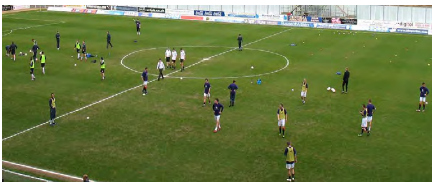
The Falkirk team at their pre-match warm-up, wearing Epilepsy Connections' T-shirts.