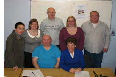
Our volunteers who will be available at the Epilepsy Hub meetings

Contact Irene on 0141 248 4125 to register your interest.