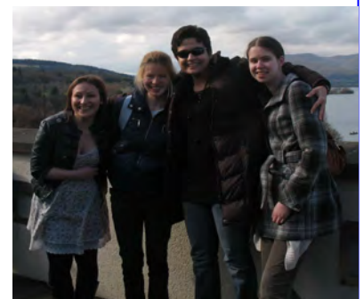
Befriending Spring Outing to Balloch