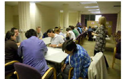
Participants at the Pentagon Centre