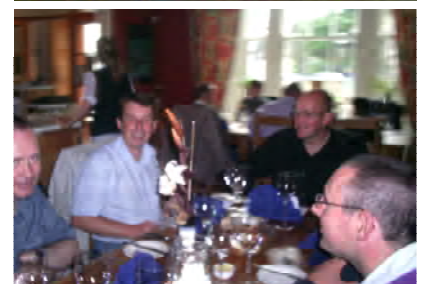
Participants at the Befriending Outing