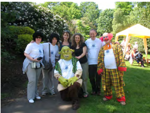
Some of the participants in the Walk in the Park event, held in Queen's Park on 22nd May 2010.

A massive thank you to everyone who participated. Sponsorship monies have raised a total of £2,118.21 to-date, with the Raffle raising £166.40.