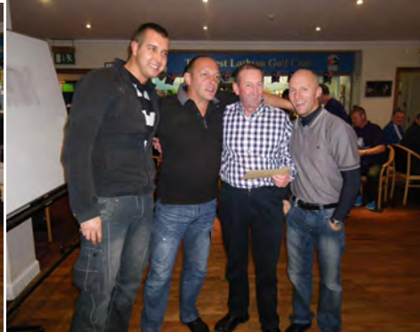
Competition winners celebrate their success.